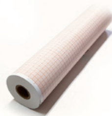
Roll Paper CP01-01D