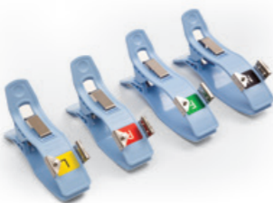
Limb Electrode(IEC) LE04-01R