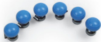
Chest Electrode CE06-01R