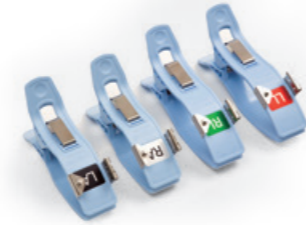
Limb Electrode(AHA) LE04-02R