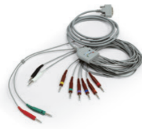
Patient Cable(AHA) CA12-02R