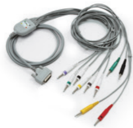
Patient Cable(IEC) CA12-01R